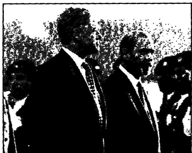
US President Bill Clinton meets with Mexican Foreign Minister Jose Angel Gurrria.